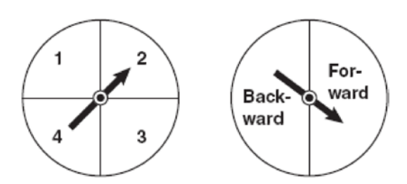
Find the probability that Brianna will move fewer than four spaces and backward.